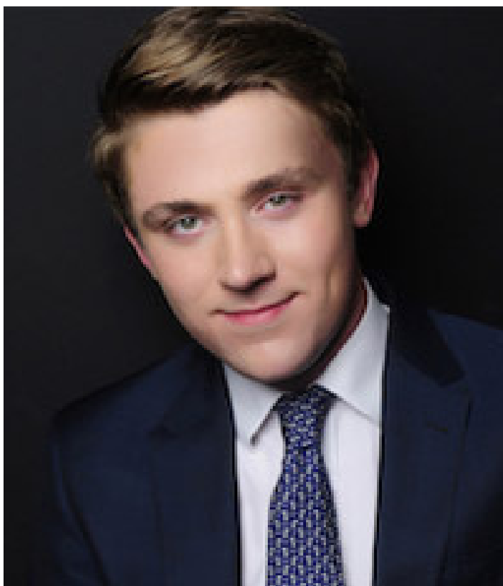
Etc so on and so forth